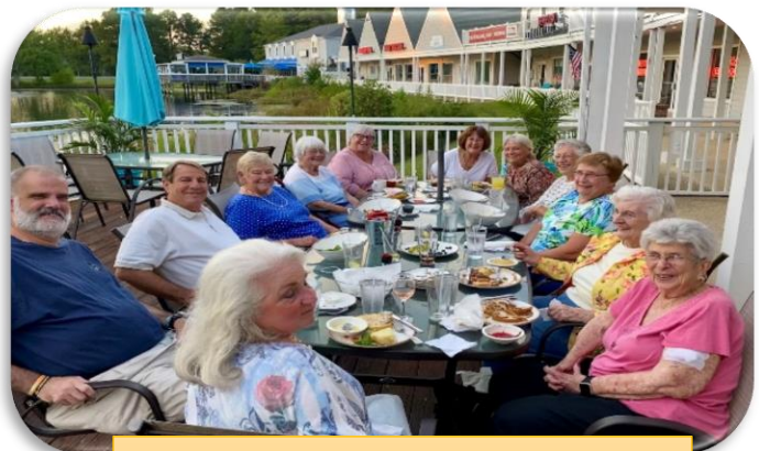
September Singles Dinner Club at Taylors Restaurant – Ocean Pines