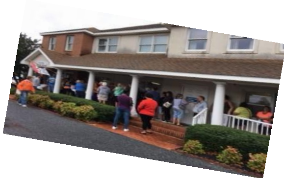
FALL ARRIVES AT THE THRIFT SHOP